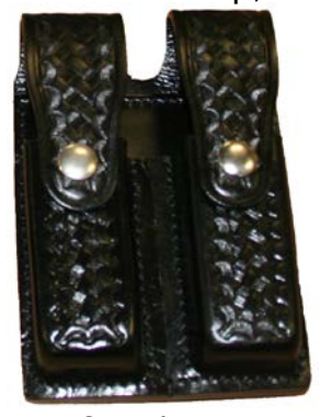
2 or 4 mags